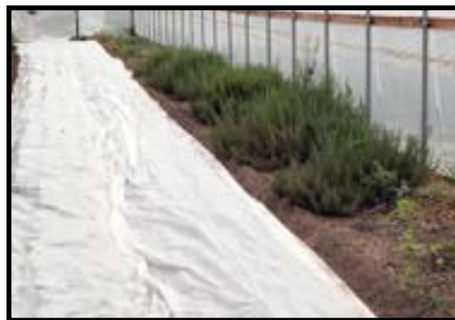
This tunnel has rosemary growing next to the sidewalls and young cool crops in the middle covered with row cover. This is to stop the rabbits from eating the tender leaves

The rule of thumb is that a tunnel can change the growing environment by three hardiness zones. Elmers mulches her rosemary heavily during the winter to protect it. While the tunnel may not change the minimum temperature very much on a cold, clear night, it can protect the soil from freezing, which can increase overwintering survival for many perennial plant species.