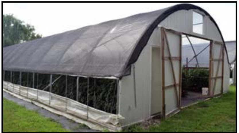
This tunnel at Gieringer's Orchard has a drop-down sidewall and open peak vent on the end wall.

Ventilation is a significant challenge for high tunnel users, particularly in areas that do not maintain consistent wind. There are a number of systems to improve ventilation. The structure can be ventilated with roll-up or drop-down sidewall ventilation combined with gable vents on the peaks of the end walls. Gable vents are very important as the rising hot air creates a current that can move a greater volume of air than would be suggested by the size of the vent. Additionally, in the winter, one of the main goals of ventilation