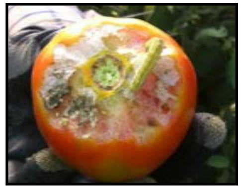
Tomato fruit worm on a tomato