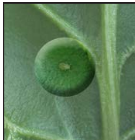
Aphid on a spinach leaf

Spinach is susceptible to aphids. Moon on the Meadow Farm releases ladybugs in the fall to prevent a buildup of the pests and this is a common control strategy.