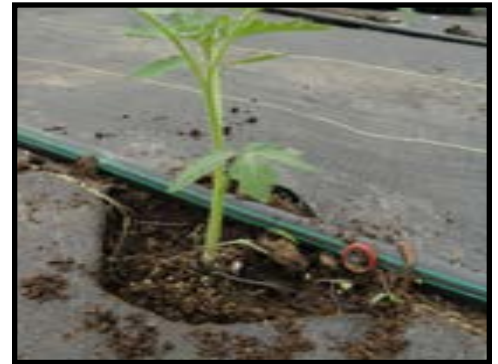
Emitter shown on drip irrigation tube watering tomatoes in a tunnel

It's important to plan your irrigation system before the plants are in the tunnel. Planning includes thinking about: plant row layout, in-row spacing, water supply, fertility needs, water use at peak demand, and choosing the specific irrigation system. Tensiometers and/or other electronic soil moisture sensors can be helpful to ensure optimal watering.