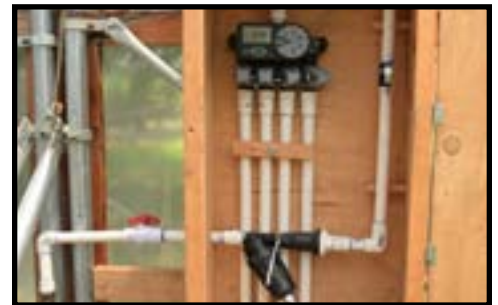
Irrigation manifold with timer at Griggs Bros. Farms.