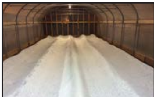
Floating row cover in a tunnel at Griggs Bros Produce

Most production in tunnels in the winter is reliant upon multiple layers of cover, including not only the