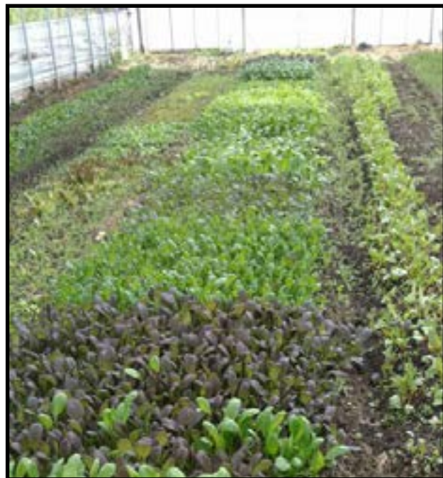
Leafy greens, C and C High Tunnels

Other Asian Greens: Tatsoi, Komatsuna, Mei Qing Choi