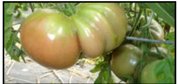
Cherokee Purple heirloom grown in a high tunnel at North Carolina State University