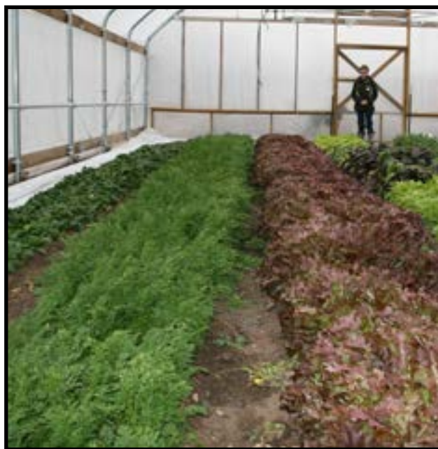
Carrots, along with spinach, lettuce and other cool crops grown at Spoon Creek Organic Farm, Gardner, Kansas

One major pest concern regarding root crops in high tunnels is damage by rodents. Trapping is the only recommended solution.