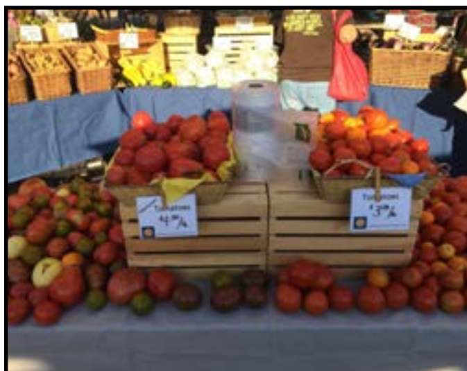
Tomatoes at Moon on the Meadow on display at a farmer's market.

The data in the tomato enterprise budget is derived from information provided by Gieringer's Orchard, Griggs Bros. Farms, and C and C High Tunnels. 2016 was a challenging year for tomato production and the yield calculated is thus far on the lower end of the generally expected range.