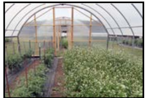
Example of crop rotation in a high tunnel. Tomatoes are shown on the left and buckwheat is used as a cover crop on the right. The crops were switched the next year. Kansas State University Olathe Horticulture Research and Extension Center.