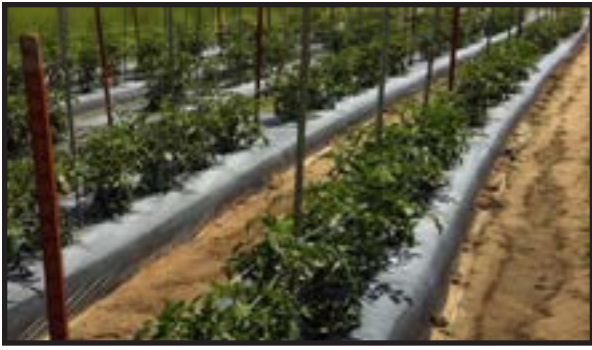
Stake-and-weave on tomatoes at John C. Pair Center, Haysville, Kansas