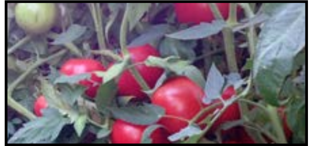
Red slicers grown in high tunnels at Griggs Bros. Farms.

Heirlooms: Any heirloom will more than likely perform better in a high tunnel. Commonly grown varieties, include Cherokee Purple, Brandywine, Striped German, Green Zebra, and Black Krim but the options are almost limitless. Heirlooms frequently suffer in the field due to high susceptibility to diseases. High tunnels can tremendously help reduce the incidence of foliar diseases.