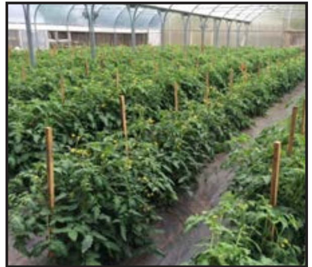
Parallel bed layout at Griggs Bros. Farms

The two main layout styles include long rows/beds that run parallel to the length of the house and ones that are perpendicular to the long axis with either a central row running down the middle of the high tunnel or paths along the sidewalls. The former layout, parallel rows, seems to be most common in Kansas and is well-suited to tall crops like tomatoes and cucumbers. Both of these layouts can be optimized for usable space, so the decision should be based upon the needed access for equipment, crop maintenance, and harvesting.