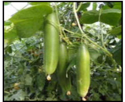
Cucumbers grown in a high tunnel