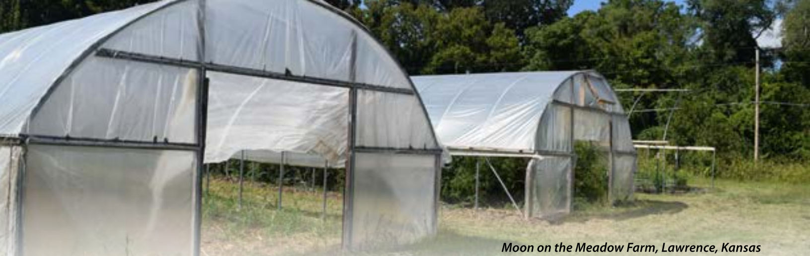
Moon on the Meadow Farm, Lawrence, Kansas