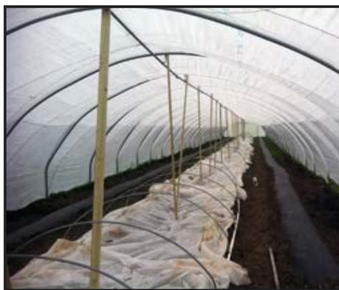
2' x 4' wood posts to hold bows in place on a three season high tunnel during a snow storm

Snow loads can also become a problem. Snow can be light and fluffy or wet and heavy depending on the conditions. To keep a tunnel from caving in from the snow requires preparation. Make sure diagonal bracing is intact to help with the load. If you have a heating system, maintain a warmer temperature to help melt the snow. Keep long-handled brooms on-hand to help brush off the snow, lumber to brace your tunnel bows and back-up poly for needed repairs. Many growers have also had success using ropes with large knots tied into them that are drawn back and forth across the peak of the tunnel to "knock" the snow down the roof.