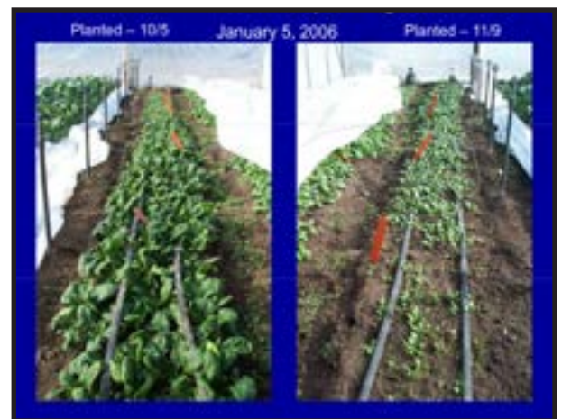
Spinach planted on different dates at Kansas State University Olathe Horticulture Research and Extension Center

The picture on the right taken in early January, shows the difference in size between crops sown in early October versus early November. Spinach sown too early in the fall or too late in the spring can have poor germination because spinach does not germinate well in high soil temperatures. Maximum spinach growth happens when temperatures range from 60 to 75°F. Spinach is more tolerant of frost burning than many other greens. Plant growth will slow as the temperature decreases and will cease at 36°F. Therefore, the crop should be kept under row cover inside the tunnel when temperatures drop below freezing. Removing the cover in above freezing weather will increase light transmission to the crop as well as increase the growth rate and reduce the humidity, which can help prevent disease.