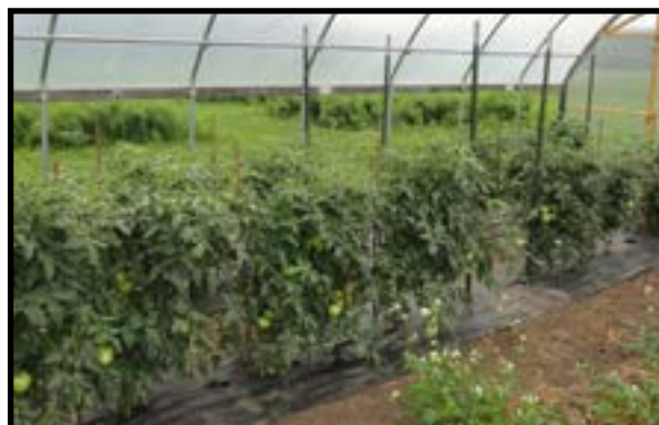
Tomatoes pruned to first hand to help increase airflow at Kansas State University Olathe Horticulture Research and Extension Center.

The goal of an IPM program is to manage pests at a level that is economically acceptable. Rather than eliminating all pests, the target is to control the amount of damage done. This is achieved using multiple lines of defense, first to minimize potential problems, second to treat as needed. This approach balances the ecological and financial impact on the farm. The primary layer of defense is preventive cultural practices. This means selecting the best varieties for the growing conditions, with the best possible resistance to existing pest and disease pressure and maintaining cleanliness in the tunnel. Other cultural practices, such as pruning tomatoes or increasing plant spacing, can improve airflow and help minimize disease pressure.