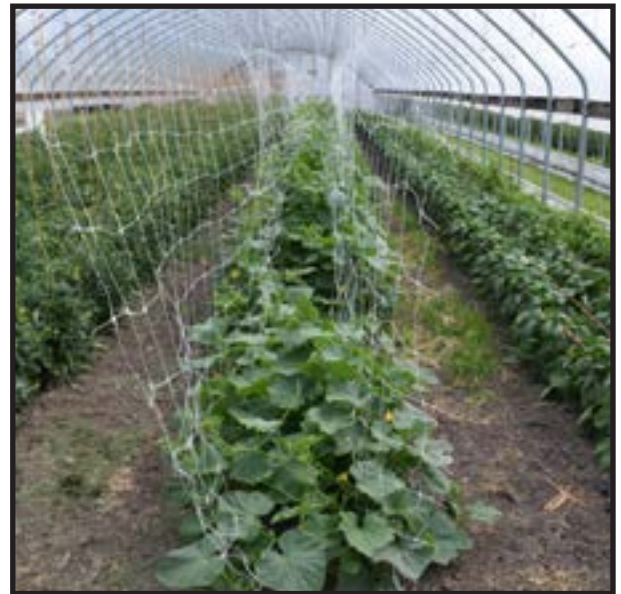
C and C High Tunnels, Scandia, Kansas

After exploring the work of five successful farms using high tunnels in Kansas, the focus will turn to specific information on management. Topics such as layout, ventilation, integrated pest management (IPM), soil management, irrigation, winter cropping and storm protection will be discussed. Other production practices such as trellising, staking and grafting will also be discussed for specific crops in this section.