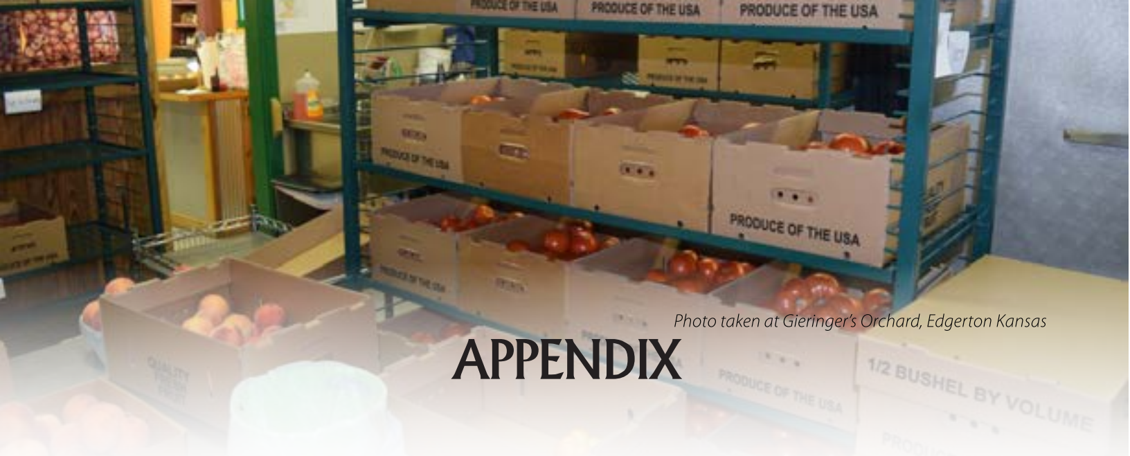
Photo taken at Gieringer's Orchard, Edgerton Kansas