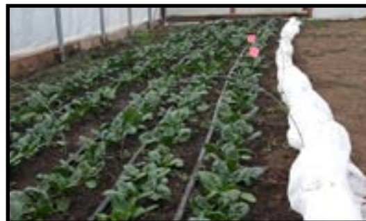
Metal hoops being utilized to protect the spinach when row covers are used at Kansas State University Olathe Horticulture and Research Center.

The second method to using a tunnel during cold weather is to harvest throughout the winter. This method is common for crops such as leafy greens, spinach and other cold-tolerant greens in Kansas. Crops must be planted earlier than those overwintered, so that they are at or close to marketable size when the days shorten enough to limit growth. Supplemental heat can encourage some growth, but daylight becomes a serious limiting factor in late December, January and early February. Crops must be selected that can handle multiple freeze and thaw cycles, and multiple layers of covering can be used to keep the crops sufficiently warm. Spinach and baby leaf salad greens in particular can be harvested and will continue to grow, albeit slowly, throughout the winter.