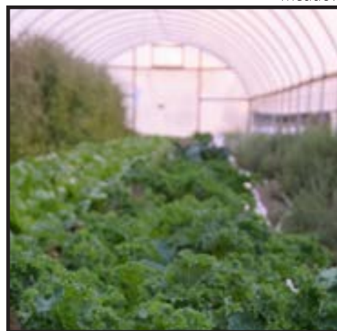
Kale growing at Moon on The Meadow