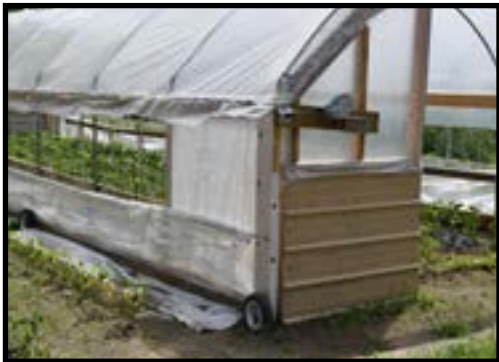
Movable high tunnel