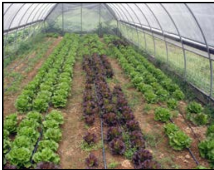
Example of head lettuce plant spacing in a high tunnel

Heads can be produced in fall and spring, or overwintered using similar techniques as discussed earlier in this volume. Head lettuce is normally transplanted, but it can be grown via direct seeding and heavy thinning to 12 inches in and between rows. Plants are spaced from six inches to one foot apart, depending size of heads