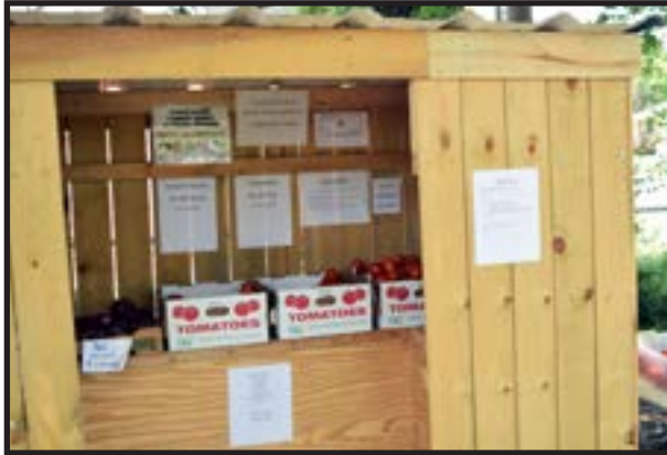
Griggs Bros. Farms honor system market stand in his driveway.