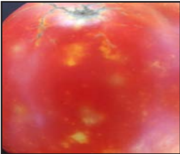
Spider mite damage on a tomato

Tomatoes are generally spaced between 18" to 24" in row, with rows spaced from 4 to 5 feet apart depending on how they are trellised and harvested. In southern Kansas, tomatoes can be planted in a hoop house as early as mid to late March. The earlier the plants are transplanted to the tunnel, the more likely it is that there will be a few nights when protection with row cover and supplemental heat is needed. Tomatoes need to be monitored during the growing season for hornworm and spider mites (see Grower Profile of Griggs Bros. Farms). Hornworms can do significant damage and can be removed by hand or killed with a spray. Beneficial mites can also be released to combat spidermites or miticides can be used.