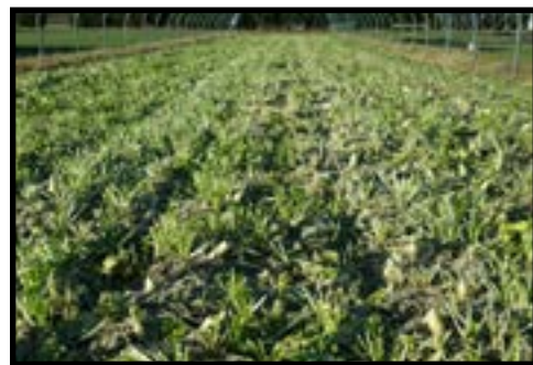
Oilseed radish used as a cover crop in a three season high tunnel at Kansas State University Olathe Horticulture and Research Center

One solution to maintaining good soil health is to add organic material. This is mentioned in the grower profiles. Using finished compost can add critical nutrients as well as organic material and can be a source for beneficial microbes. Excessive use of compost, however, can contribute to salt buildup, which can become a serious issue and difficult to remediate. To address concerns of salt buildup and disease, some growers across the nation have removed soil and replaced it, but that is not a common strategy in Kansas. To reduce soil salinity,