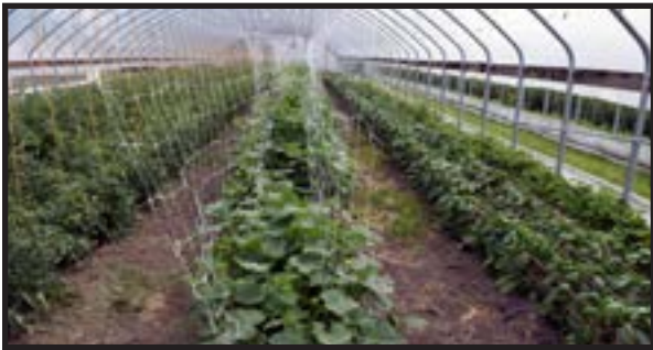
Mesh trellis used on cucurbits at C and C High Tunnels

The Florida/California stake-and-weave technique, is commonly used for tomatoes, peppers and eggplant grown in high tunnels. Wooden or metal posts, usually 5' to 8' tall, are set about a foot deep in line with the row between every other plant. Once the plants are about 10 to 12 inches tall, strings need to be added roughly once per week until the plants shift to fruit production. This should be done so that each string added is placed just below the top of the canopy of the plant. Tie twine to the end stake and run it down the row, wrapping it around each stake as you go. Do not "weave" the plants and be sure to keep the string between yourself and the plants at all times. At the far end of the row, wrap the twine a couple of times around the end stake, and return up the other side of the row in the same fashion. Put a pair of lines like this on each side of the row as the plants grow, usually every eight inches or so.