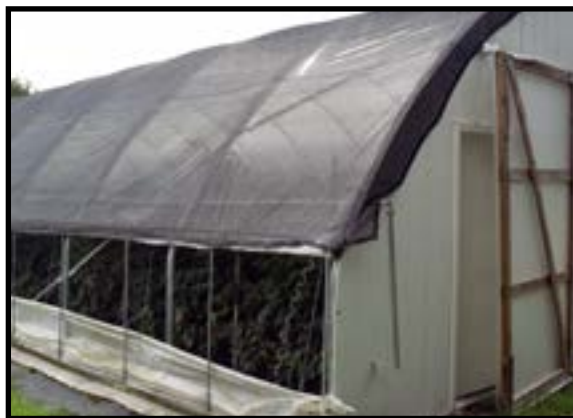
40% shade cloth installed on a high tunnel