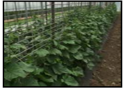
Cucumbers growing on cattle panels in a high tunnel

Pruning: Pruning can be beneficial for cucumbers. Andrew Mefferd of Growing for Market suggests pruning the buds of larger fruited varieties to one fruit per node to increase size and consistency of fruit (May 2014). Only parthenocarpic cucumbers should be pruned to single leader. Traditional field cucumbers fruit on runner shoots, and if these are removed fruiting will not occur.