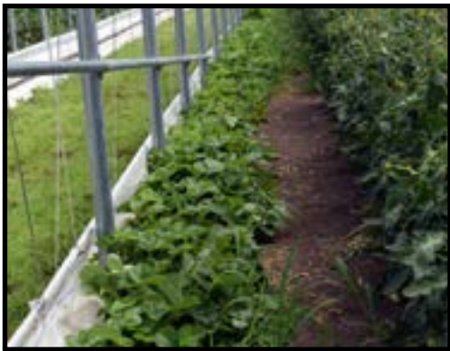
Strawberries grow along the edge of a tunnel while tomatoes growing to the right.

The 2016 summer growing season emphasized the value of high tunnel growing for the Janssens. While weather conditions kept most growers in the region from being able to produce many tomatoes, the environmental control of the high tunnels allowed C and C to successfully produce a tomato crop. This guaranteed them a steady flow of customers and high prices through the main market season.