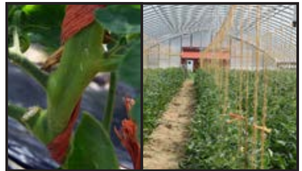
String trellising at C and C High Tunnels

European string trellises are a very efficient use of space and work well in high tunnels that have the structure to support them. This method is common for indeterminate tomatoes and cucumbers. A string is run from floor to ceiling and the vines are attached with plastic clips or other methods. Tomato plants are traditionally pruned down to a single leader, but can be managed with two or more, particularly if grafted plants are used.