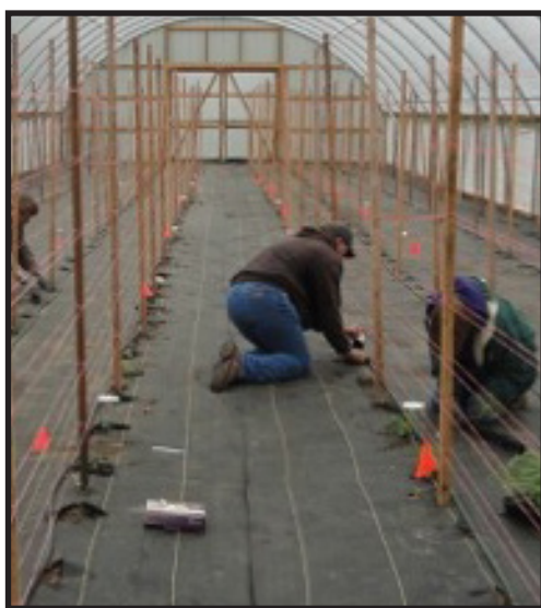
Laying landscape fabric and assembling the trellis system in a tunnel at Gieringer's Orchard during the winter

The Gieringers focus their high tunnel production on tomatoes and tailor their growing practices to fit with their overall farm system. A big part of that comes from their efforts to minimize labor during the growing season while producing a high volume of large, red slicing tomatoes for their markets. To accomplish this, they use a very specific production protocol. In the winter, composted cow manure is spread in a fairly heavy application. Afterwards, a high pressure drip irrigation system is installed, and landscape fabric (aka woven groundcover) with pre-cut holes for the tomato plants is laid down to prevent weeds. Both the drip systems and fabric can be reused every year. The entire tunnel floor is covered with groundcover, which prevents weed growth throughout the season, and minimizes the in-season labor. The trellis system, which is a modification of the stake-and-weave method, is