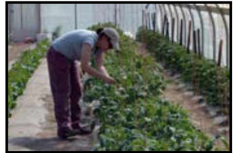
Scouting for pests

For Kansas high tunnel tomato growers, a particular challenge related to preventative IPM practices is crop rotation. Given the profit potential of tomatoes in local markets and the significant benefit of growing them in high tunnel systems, rotation becomes a practice that is often overlooked. Realizing many growers will either ignore rotation or have very short rotation intervals, paying attention to other preventative practices that might mitigate the impact of soilborne disease is critical. Examples of such practices include bringing in additional organic material such as compost in the offseason, strict sanitation methods including removal of all plant debris, and growing plants that are grafted with disease resistant rootstocks. Some growers, like Gieringer's Orchard, have grown tomatoes continuously in the same tunnels for many years. Although this is typically not recommended, they have had good success thus far due to bringing in additional compost in the winter and using grafted tomato plants.