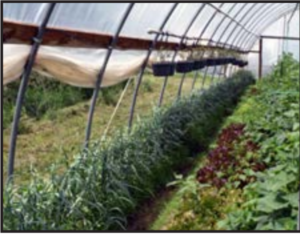
This tunnel pictured in May shows some of the diverse production at Jay's Jellies, Produce and More. On the left garlic, in the middle, head lettuce and cucumbers are growing side by side and on the right cherry tomatoes are getting ready to start producing.