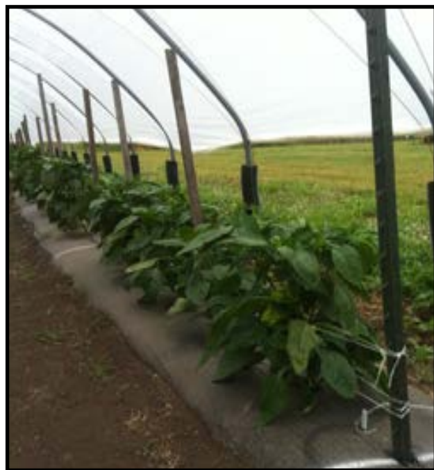
Peppers using the stake-and-weave method for support at Kansas State University Olathe Horticulture Research and Extension Center