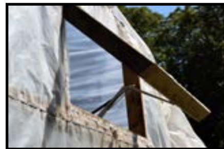
A farm-built automatic peak vent using a UniVent opener

A homemade automatic gable vent at Moon on the Meadow Farm (pictured right) is a nice way to add automation to ventilation. Even with automation, these vents still requires someone to monitor the automated ventilation in the mornings and the evenings. Even though the labor of ventilation is just a few minutes a day of labor, it can create a certain scheduling hassle and yet it is absolutely critical.