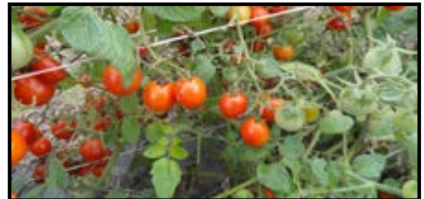
Cherry tomatoes grown in a high tunnel at Kansas State University Olathe Horticulture Research and Extension Center