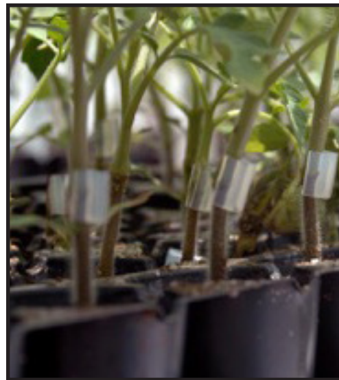
Tomato grafting at Kansas State University Olathe Horticulture Research and Extension Center

Many growers locally and worldwide are finding the advantages of using grafted plants, particularly when used in high tunnels. Grafted plants help overcome abiotic and biotic crop stress, help with nutrient plant uptake, and increase fruit yield per plant. The most commonly grafted vegetable plants in the United States are tomatoes, but grafting is possible with a variety of other vegetables. Grafted plants are produced by attaching the scion of a variety with good fruit production characteristics to a rootstock that adds vigor and resistance to root-infecting pathogens. The grafting process occurs when the plants are small seedlings and can add significant cost to the price of a transplant. However, high tunnel growers in Kansas are finding that certain rootstocks can increase yield by 20 to 50% and sometimes more. “The [grafted tomato] plants are significantly more expensive and challenging to find but the boost in yield makes up for the difference.” says Brice Wiswell of Gieringer’s Orchard who plants only grafted plants in their high tunnels. The process of grafting is somewhat complicated and requires careful management in the healing stages. To get more information, refer to the resources section in this manual.