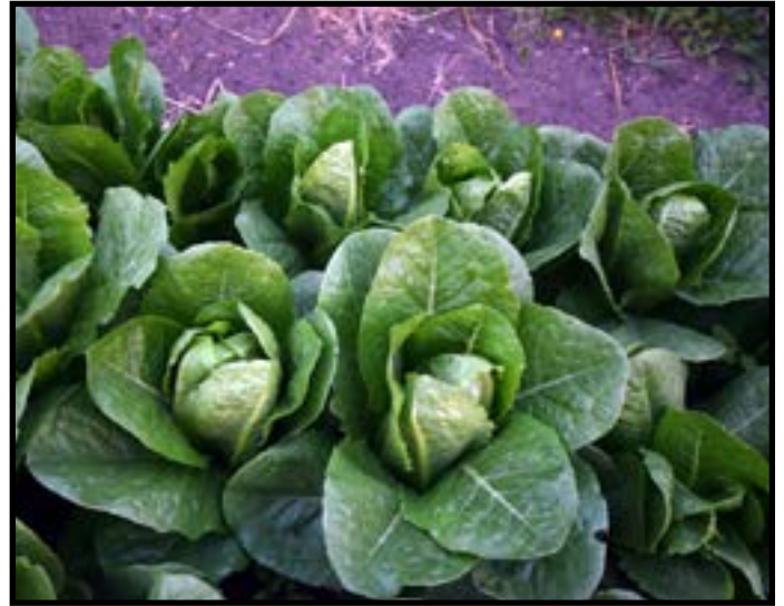
Head lettuce being grown in a high tunnel at Moon over the Meadow farm

heads desired. Rows are usually spaced at the same interval to fill the bed. If temperatures drop below freezing, lettuce should be protected with row cover. Heads that are fully developed are more susceptible to cold temperature injury than plants that are not yet mature.