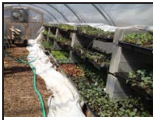
Transplant production at Moon on the Meadow