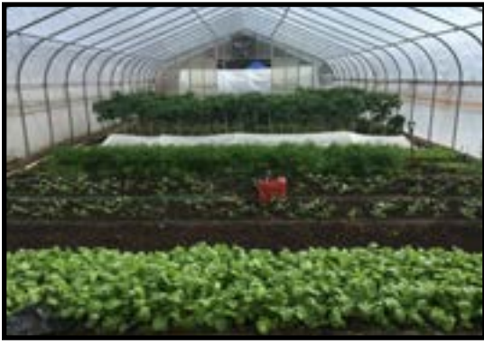
Perpendicular crop layout in a tunnel at Growing Home, Chicago, Illinois

level beds tend to retain heat more efficiently in the winter. The toughest areas to utilize are directly along the sidewalls, particularly if the high tunnel has short sidewalls. Many growers are building tunnels that have 5' to 8' sidewalls in order to increase production space, but the location along the sidewall makes it cooler and damper in the winter than the rest of the tunnel. Similarly, growers may find more disease on plants along the sidewalls, especially if they are not closed during rain events. If the surrounding area outside is not graded to drain away from the tunnel, the area around the sidewalls is prone to water infiltration during heavy rains. Planting crops that