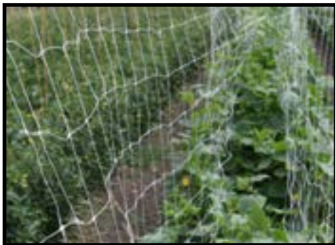
Cucumbers growing on a mesh netting at C and C High Tunnels

Cucumbers need adequate space to grow for maximum yield. Recommended plant spacing is 12 inches apart and row spacing is four to six feet apart. They are also a water-demanding crop and daily watering is recommended. Cucumbers grow quickly in high tunnels, but do not grow well in cool soils and will not survive any type of frost or freeze event. Early planting may not benefit the grower if soil temperatures have not adequately warmed up above 60°F.